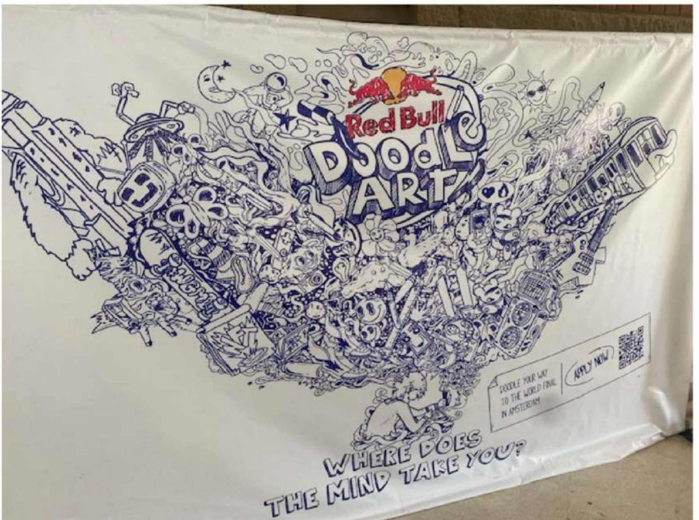
Red Bull took over the campus by a storm. It was a fun filled afternoon where students showcased their prowess in doodling. There was music, laughter, doodling, and of course, Red Bull. It sure gave everyone wings!